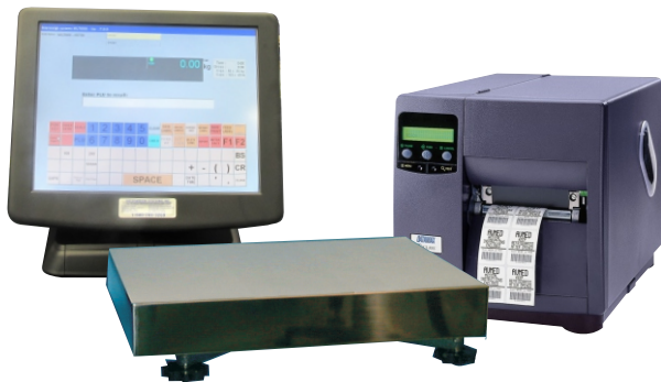
WEIGH LABELLING SYSTEMS