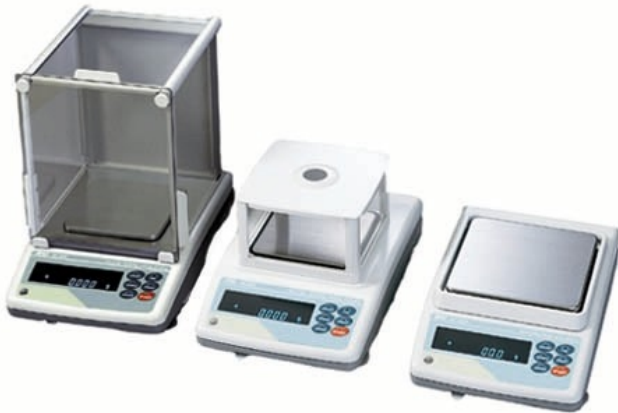
ANALYTICAL AND TOP LOADING BALANCES