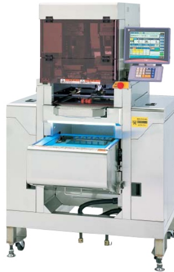
WEIGH, WRAP & LABEL