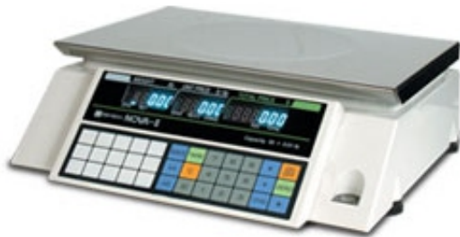
PRICE COMPUTING SCALE