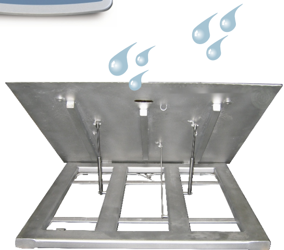
EASY CLEAN STAINLESS STEEL LIFTDECK / FLOOR SCALES