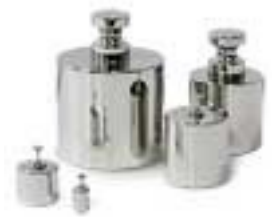
PRECISION TEST WEIGHTS AND WEIGHT CALIBRATION