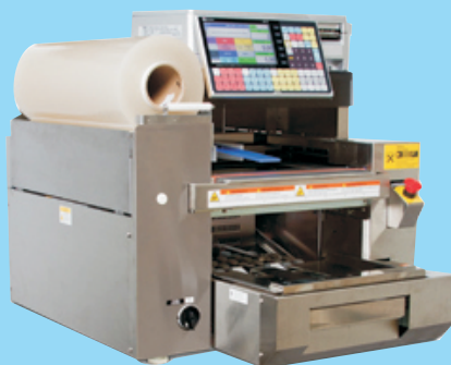
WEIGH, WRAP & LABEL