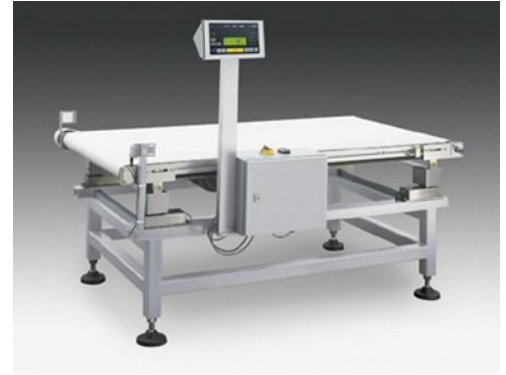
IN-LINE CONVEYOR SCALES