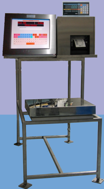
WL-7000 BOX SCALE AND LABELLER

I N T E R W E I G H S Y S T E M S I N C.