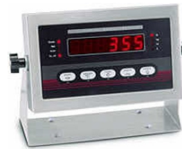
PROGRAMMABLE DIGITAL INDICATORS