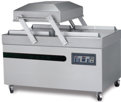
SWING LID VACUUM SEALERS