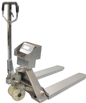
STAINLESS STEEL PALLET TRUCK SCALE