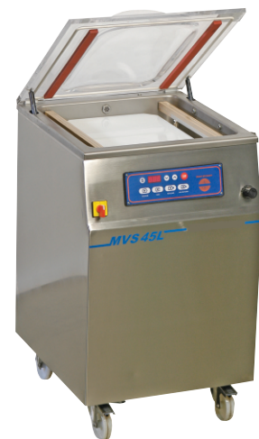
FLOOR MODEL VACUUM SEALERS