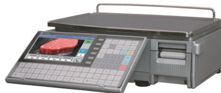
PRICE COMPUTING WITH LABEL PRINTER