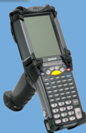
SCANNERS AND PORTABLE DATA TERMINALS